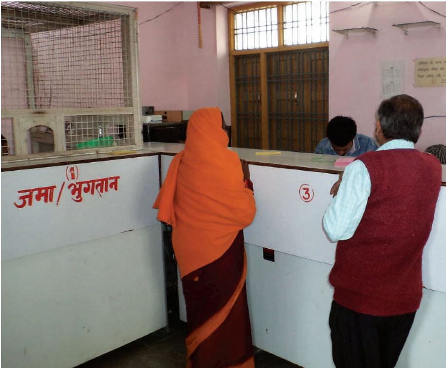
Members engaging in financial transactions at AKCCS' Phulwarisharif Branch

own the enterprise, take and implement decisions as well as benefit from the enterprise. Sahulat Microfinance Society has chosen to adopt cooperative approach for this reason besides its democratic functioning and peoples' participation.